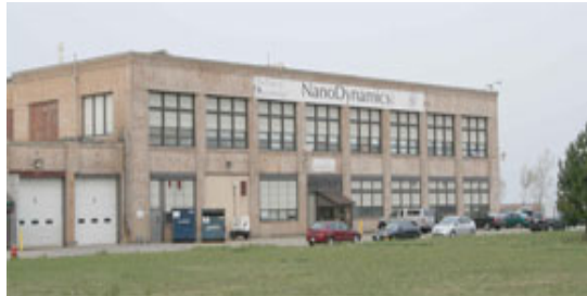
Port Terminal A

C. Waterfront Properties: The NFTA’s desire to explore the sale of the NFTA’s waterfront properties has resulted in a large amount of work for the Office of General Counsel. Staff has been working on the sale of the entire holdings. The Port Terminals are to be sold to Gracious Living Corporation and the rest of the waterfront to the Erie Canal Harbor Development Corporation. These deals have involved extensive negotiations over the acquisition agreements, SEQRA compliance and responses to due diligence investigations and interactions with numerous government entities including the Department of Environmental Conservation, New York State Parks Recreation & Historic Preservation, and Empire State Development Corporation.