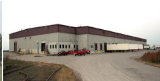
Port Terminal B

D. Outer Harbor Concert Series: The concert series blossomed in 2013. The number of concerts doubled to six and featured nationally known acts such as Guns ‘N Roses and the Tragically Hip.